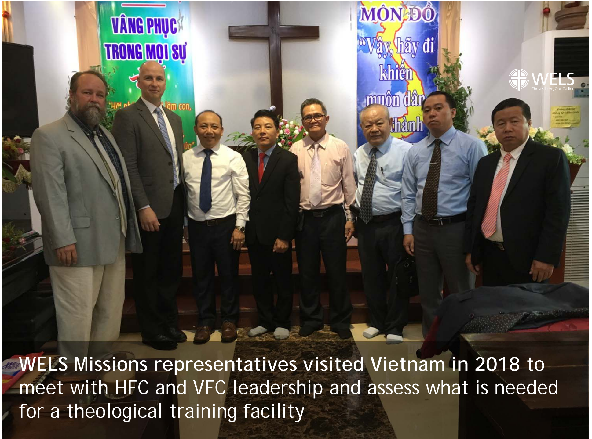
WELS Missions representatives visited Vietnam in 2018 to meet with HFC and VFC leadership and assess what is needed for a theological training facility